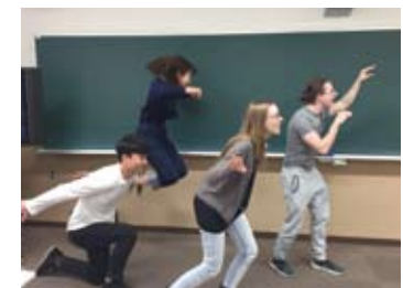
Winter Intensive Period Project Work : Speaking “Expression and acting”